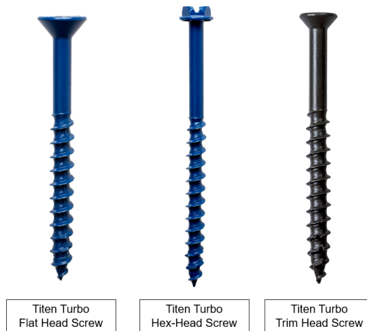
FIGURE 1 – TITEN TURBO™ SCREW ANCHORS