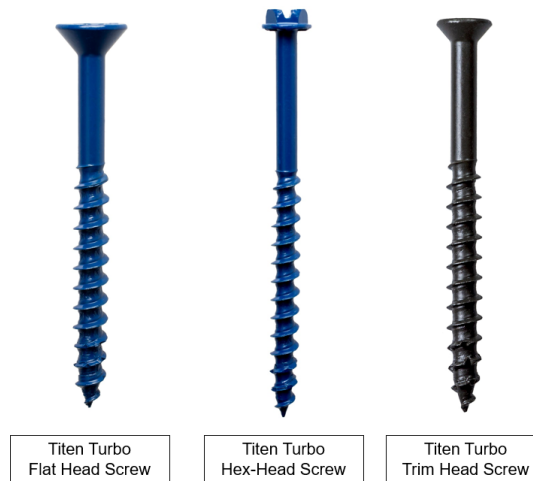
FIGURE 1 – TITEN TURBO™ SCREW ANCHORS

3 Screw anchors may be installed at any location in the wall face provided the minimum edge and end distances are maintained.