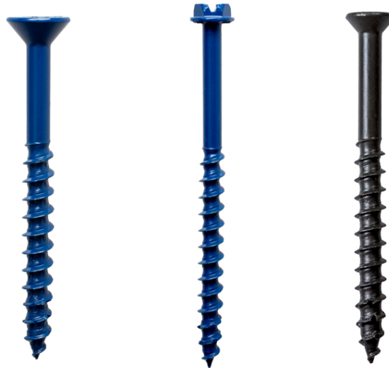
Titen Turbo Flat Head Screw