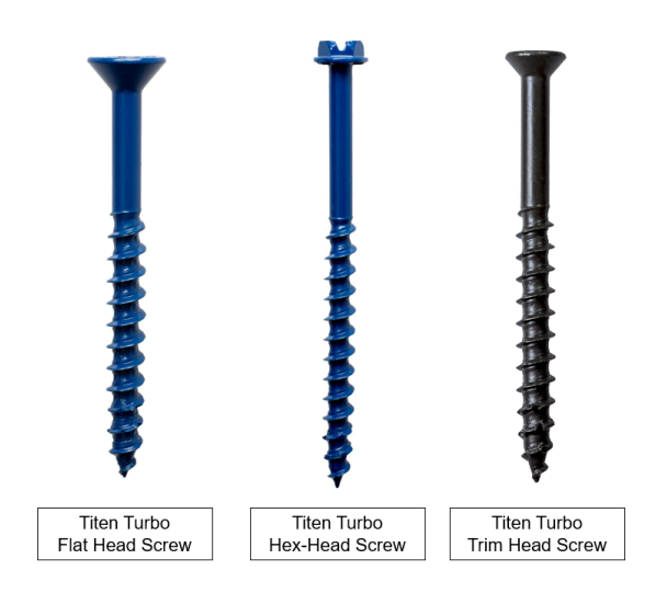
FIGURE 1 – TITEN TURBOTM SCREW ANCHORS