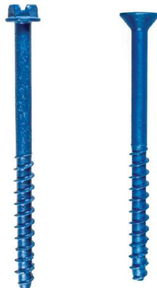
Figure 1 – Titen®2 Screw Anchors