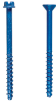
Figure 1 – Titen®2 Screw Anchors